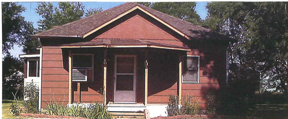
Although this information is not guaranteed, it is believed to be accurate.

3 BEDROOMS - 1 FULL BATH - TOTALLY RENOVATED 4 YEARS AGO - UPDATED WIRING and PLUMBING INSULATED WALLS & ATTIC - THERMOPANE WINDOWS - MASONITE SIDING - NEW ROOF JUNE 2017 PELLET HEATING STOVE - HICKORY KITCHEN CABINETS - ALL FURNITURE IS INCLUDED WITH THE SALE. Wall hangings are not included. Property is decorated in "lodge-theme" furnishings. Neutral carpets in all bedrooms and living room. Oak flooring at the entrance. Laminate flooring in kitchen/dining/laundry. Appliances included: washer & dryer, gas range, dishwasher, range hood, microwave and window air conditioner, freezer. Un-installed furnace in back entrance room is included. Living room has a bay window seat. Entrance to the screened-in porch from the kitchen. Storage cabinets & shelves in back room. Duct work for furnace has been installed. Large yard consists of 3 lots & an unused street (which can't be built on). There's a privacy fenced area and a 10'x12' yard shed. NOTICABLE ATTENTION TO DETAIL. Experience the Magic of Comstock from this unique property!